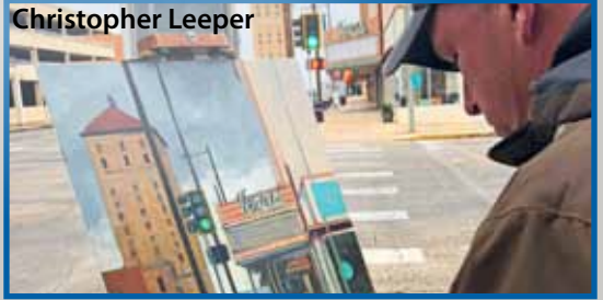
Downtown San Angelo/ ML Leddy's