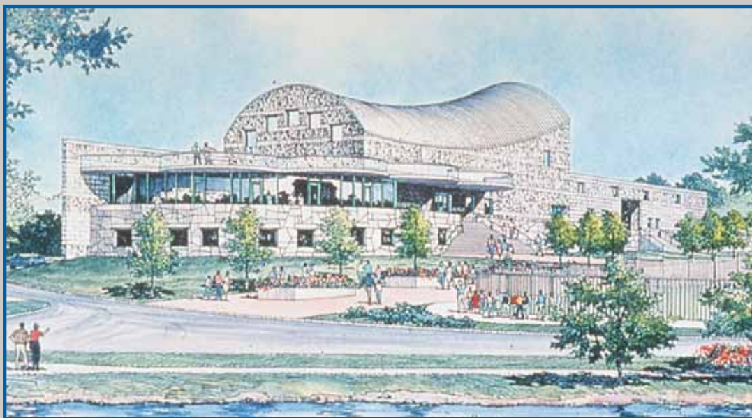
Artist rendering of the San Angelo Museum of Fine Arts, June 1996

Among the Permanent Collection's areas of concentration, SAMFA has established a distinguished collection of contemporary American ceramics, as well as ceramics from Europe, Canada, and Asia. Other focus areas of the collection include early and contemporary Texas art, Spanish Colonial and 19th century Latin American art, and American manufactured glass. The museum's exhibit program is encyclopedic.